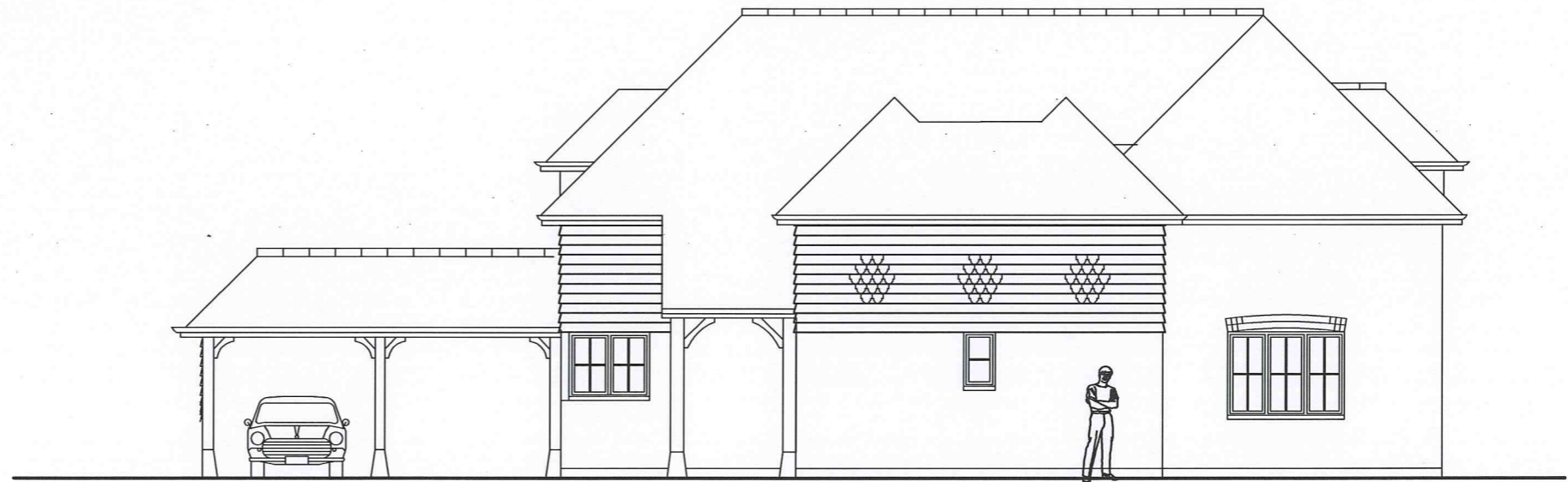
HOUSE 2 - SIDE ELEVATION ( TO MONKS BARN)